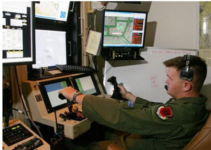
Fig. 3. Image showing a drone pilot in operation of a reaper drone.

A common perception of drone warfare is that it takes marginal skill and expertise to manage, and because of this, the operators cannot fully grasp the immensity of their actions and the greater impact those actions can have. The United States government goes so far as to encourage this perception by marketing the drone programs to people who play video games, even kids. The operation of a drone aircraft is so similar to the controls of a video game that the military has cooperated to produce flight and combat simulators to emulate the process in the hopes of recruiting more and more drone pilots for the ever-increasing drone arsenal. This is like hiring a bus driver to fly a commercial airliner. Air Force pilots go through years of rigorous training to fully immerse themselves in the gravity of flying a plane designed to kill. Drone pilots have been deregulated and require nowhere near the same qualifications as pilots that fly inside of a cockpit. In some sense, this is to be expected. In another sense, operator error now poses an increased risk in this endeavor with pilots who have not received ample training.