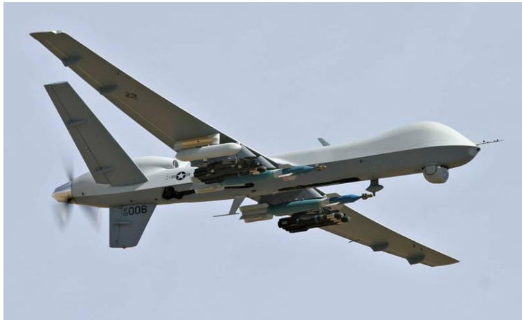
Fig. 2. The underbelly of a fully armed reaper drone en route.

Keywords: Air safety, appropriate technology, electrical engineering, ethics, international relations, military aircraft, military computing, standards, telerobotics, unmanned aerial vehicles.