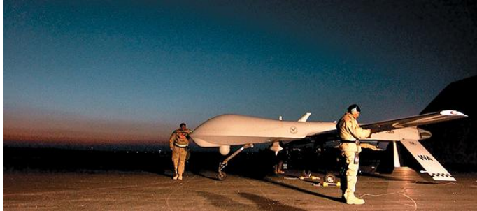
Fig. 6. The sun rising on a Predator drone as maintenance is done. http://www.af.mil/shared/media/photodb/photos/030313-F-1644L-024.jpg