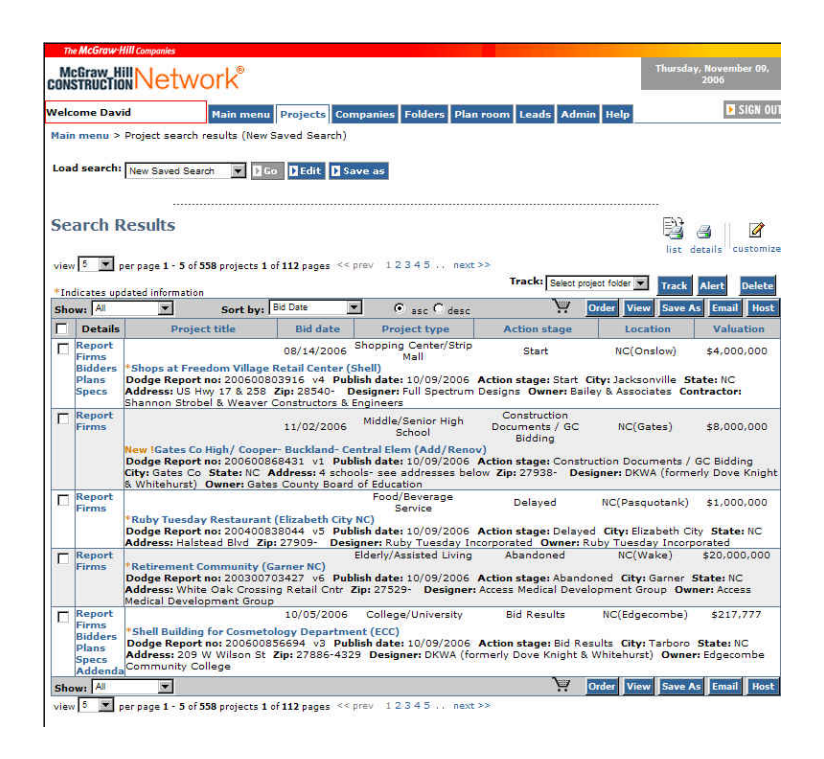
Figure 1: McGraw-Hill Construction Network Platform