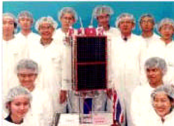
Figure 1: Thai-Paht, a micro satellite [5]

AT the MUT, there are two different programs in the undergraduate. One is a regular program, four years of study with 150 credit hours and the other one is a three-year program for technical students, who had studied in technical colleges for two years before getting in the university. The students in the second program have to earn 108 credit hours before getting a bachelor's degree in civil engineering. The MUT provides courses for the undergraduate in structural, construction, transportation and survey, soil mechanics, hydraulics and environmental engineering [4].