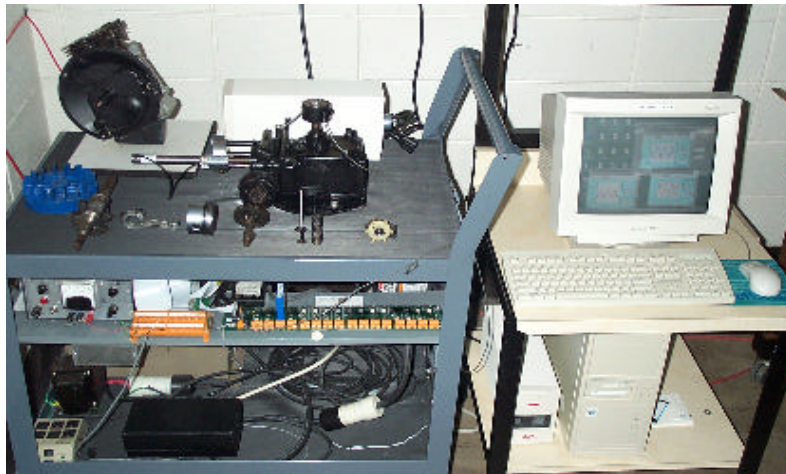
Kinematics of Motion for Piston-Cam System

Information related to operating this system ON-LINE along with information about other modern laboratory systems can be found at web site: http://www.reallabs.net . This web site is maintained by Creative Engineering, a company building turnkey modern laboratory systems like those described in this paper.